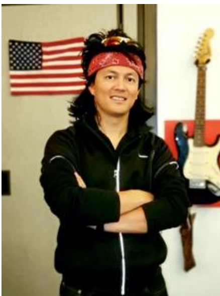
Meet our new staff member!