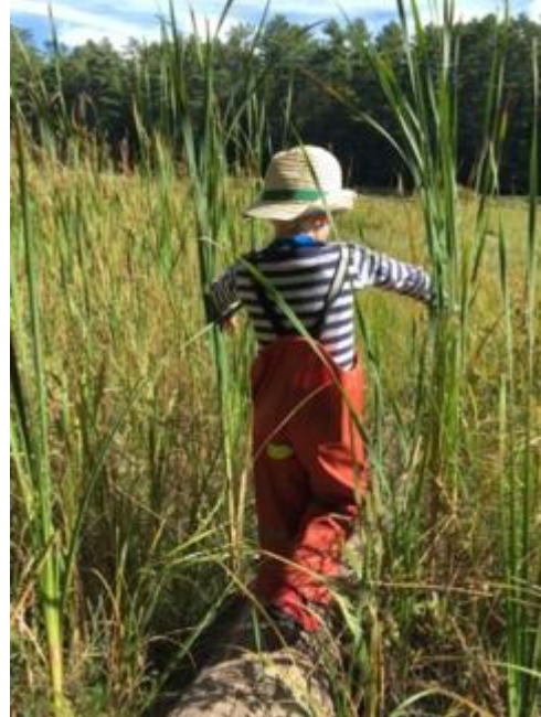
Photos taken at Juniper Hill School in Alna, ME

Enjoy a woodfired pizza and a farm-fresh salad while supporting the HES first grade class build their Nature-Based program. Proceeds will help acquire the gear they need to stay dry, warm and safe while learning outside.